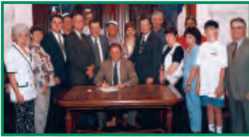
Governor Bush signs the 1997 Truck Length and Safety Bill in the presence of friends, TLC members and Texas legislators.